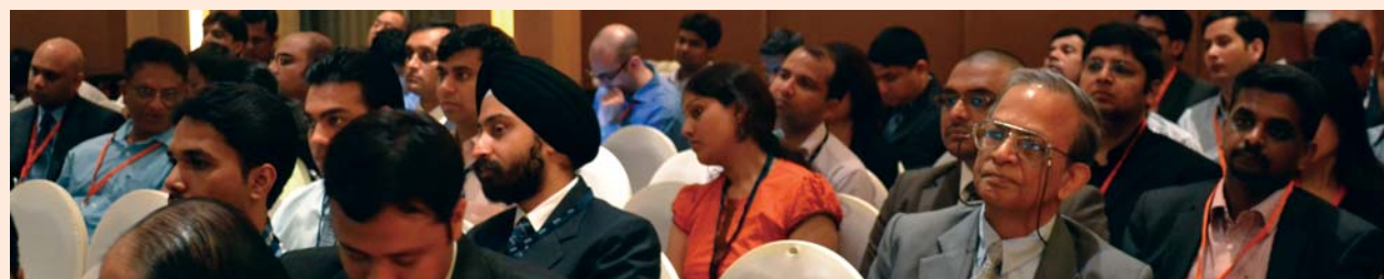
A Cross Section of the audience during GIPC 2011