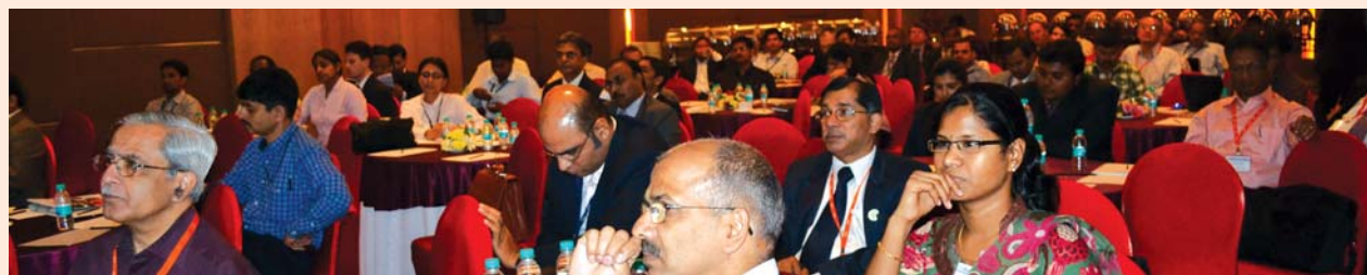
A cross section of the Audience in GIPC 2011