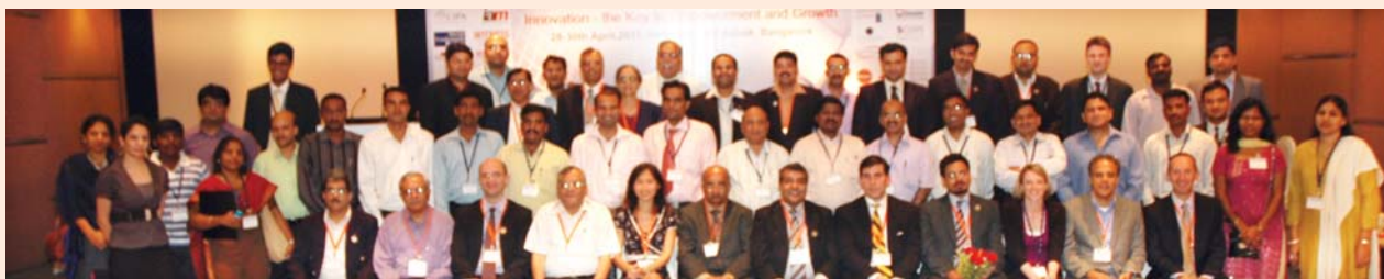
Group Photo with all the speakers and delegates