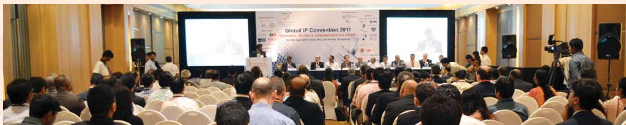
Global IP Convention 2011 hall 1 during a session